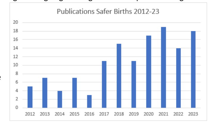
Figure 3. Publications Safer Births annually from 2012 – 2023.

local champions who can facilitate CQI and simulation training is considered essential for these processes to happen, and to stimulate a gradual and sustainable culture change. In 2019, SBBC won a World Bank Global Financing Facility innovation-to-scale award to test implementation of the package in 30 healthcare facilities in five regions in mainland Tanzania. The roll-out is led by HLH in close collaboration with the Ministry of Health and UNICEF in Tanzania. Increased maternal and newborn survival worldwide should be possible with a combination of HBB, HMS and available Safer Births innovations for clinical practice and